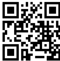
Example QR code by “eBanking – but secure!”

Users cannot usually see what kind of information is coded into them before scanning in a QR code. If possible, they should therefore use a QR code scanner (app) which displays the decoded contents first and asks them whether they would actually like to visit a link or execute a certain action.